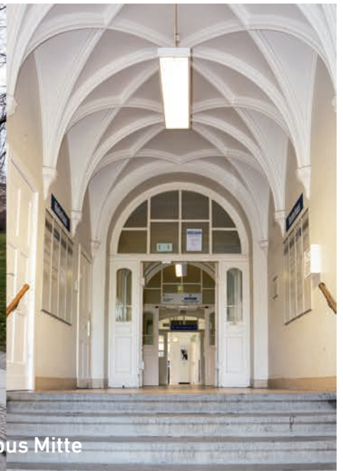
Department of Psychiatry and Psychotherapy at the Charité Campus Mitte