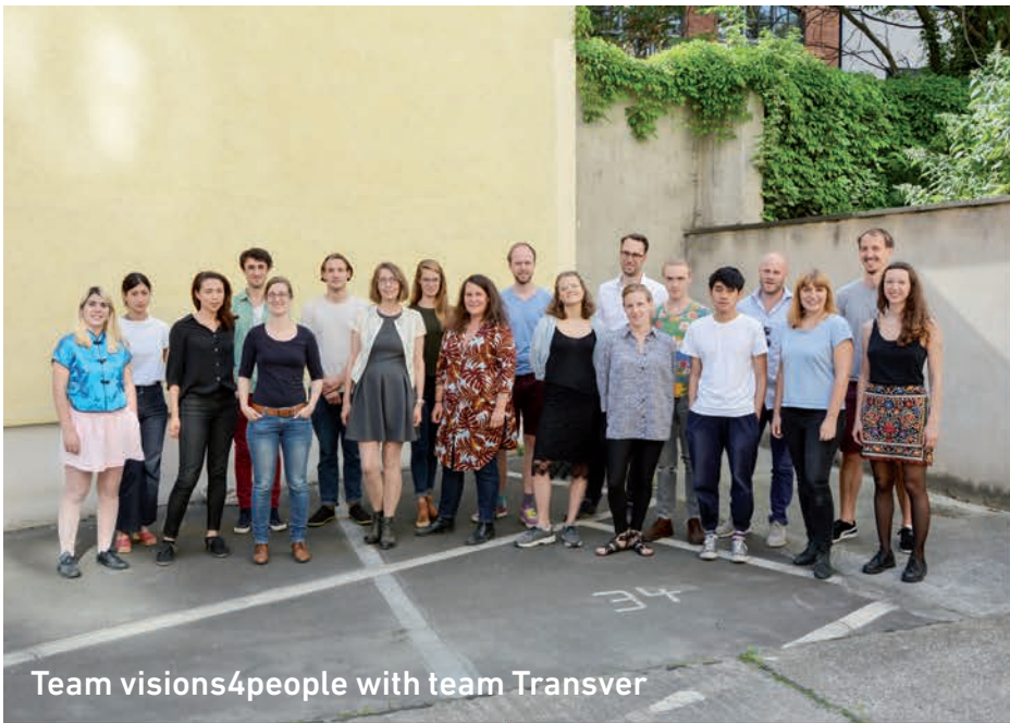
Team visions4people with team Transver